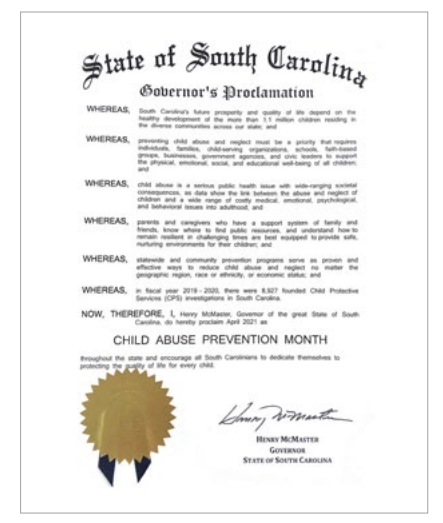
An example of a proclamation from the Governor.

To help us coordinate and track proclamations, please submit the brief form on <a href="scchildren.org/capmonth">scChildren.org/capmonth</a>. We will then share the news on our social channels and website.